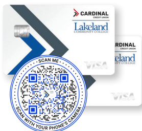
Scan for Rewards

Double cash back rewards for purchases made at Lakeland Community College.