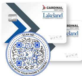
Scan for Rewards

Double cash back rewards for purchases made at Lakeland Community College.